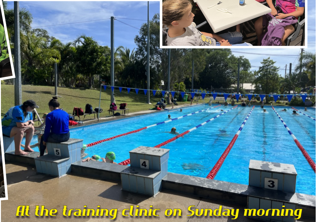
At the training clinic on Sunday morning