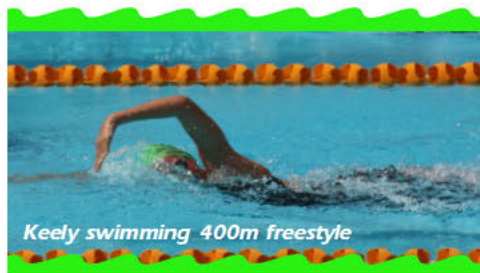
Keely swimming 400m freestyle

The carnival took on the format of heats and finals each day, with finals commencing at 6pm on the first day, and an hour after the main programme had finished on the Sunday, allowing families travelling time back home from late afternoon and evening.