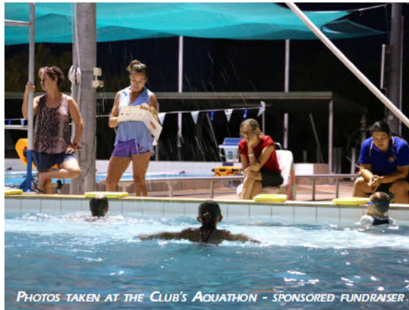
PHOTOS TAKEN AT THE CLUB'S AQUATHON - SPONSORED FUNDRAISER.