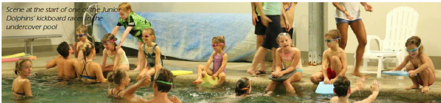
Scene at the start of one of the Junior Dolphins' kickboard races in the undercover pool

Club Nights attracted a good crowd of our members each week through the last school term of the year; there would be up to a dozen Junior Dolphins at our fun novelty races in the undercover pool, with steady progress being made in their competencies.