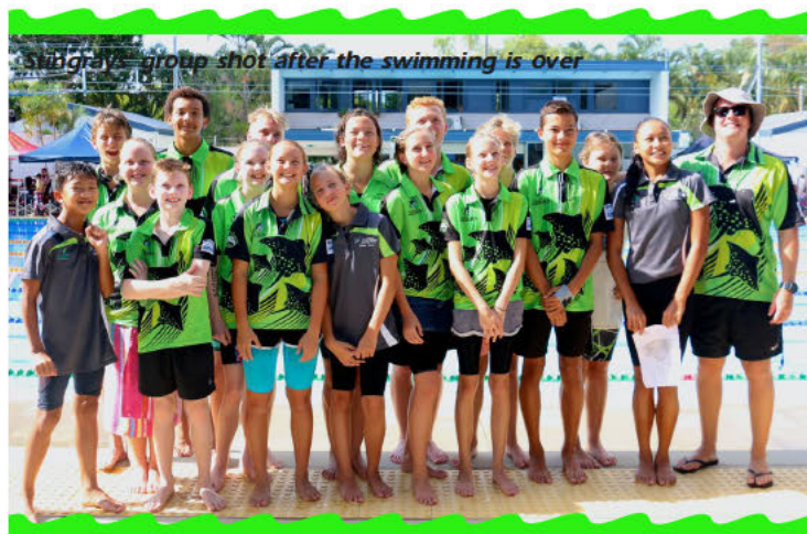
Stingray group shot after the swimming is over