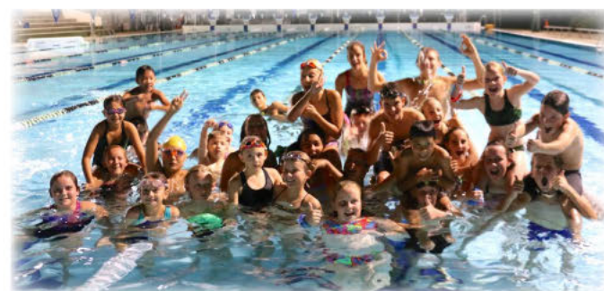
Celebratory impromptu group shot after the Aquathon was over