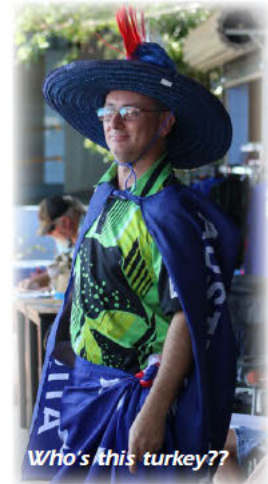
Who's this turkey??