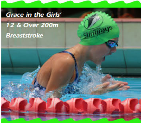
Grace in the Girls' 12 & Over 200m Breaststroke