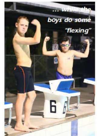
... while the boys do some "flexing"