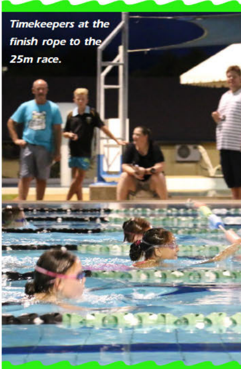
Timekeepers at the finish rope to the 25m race.