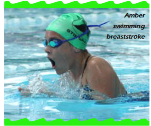
Amber swimming breaststroke

All in all, a rewarding and eventful carnival where it was noticeable that the performance put in by our Stingrays swimmers was excellent – a tribute to the hard work spent training during the weeks.