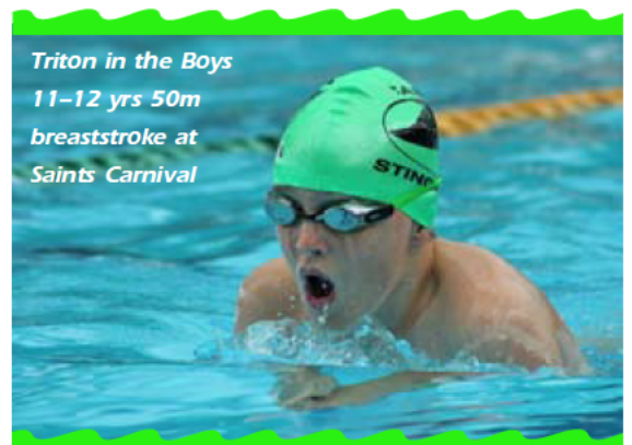
Triton in the Boys 11-12 yrs 50m breaststroke at Saints Carnival