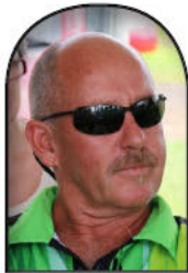
FUNDRAISING Edelweis Diola