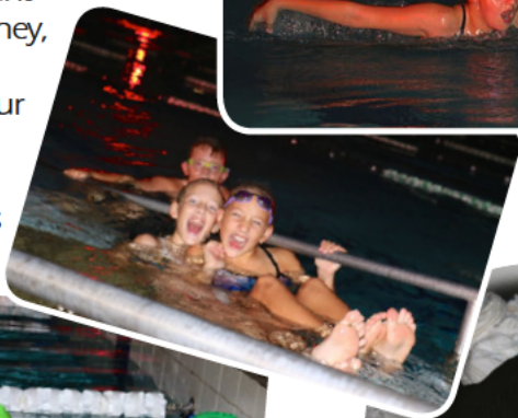
Some photos of the swimmers, and the cheer squad urging them on.