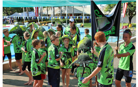
For the March Past we looked resplendent in our new shirts, topped off with the stingray hats again.