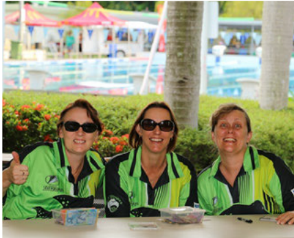
Stingrays' ladies stationed on the front desk taking the entrance monies.