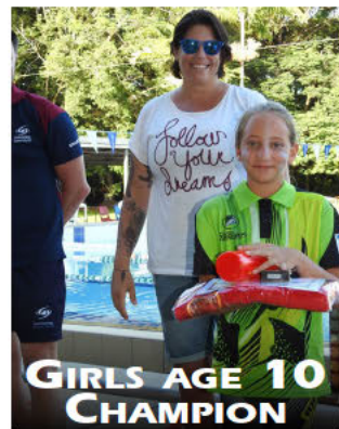
GIRLS AGE 10 CHAMPION