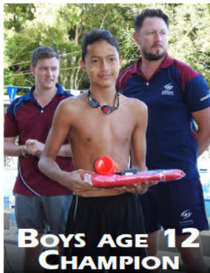
BOYS AGE 12 CHAMPION