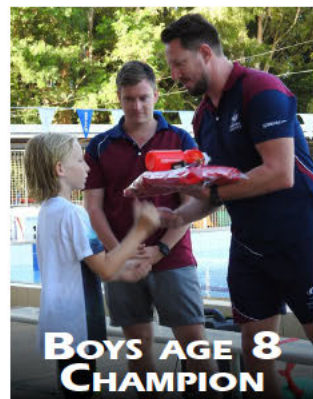
BOYS AGE 8 CHAMPION