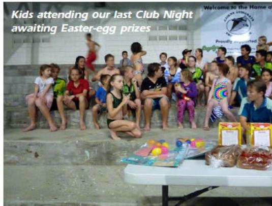
Kids attending our last Club Night awaiting Easter-egg prizes