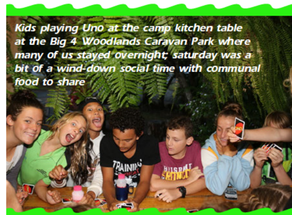
Kids playing Uno at the camp kitchen table at the Big 4 Woodlands Caravan Park where many of us stayed overnight; Saturday was a bit of a wind-down social time with communal food to share