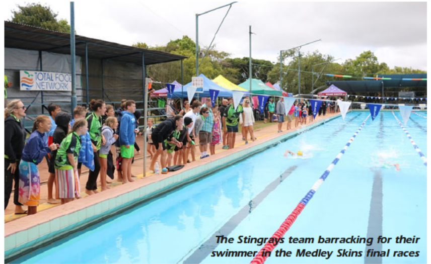
The Stingrays team barracking for their swimmer in the Medley Skins final races